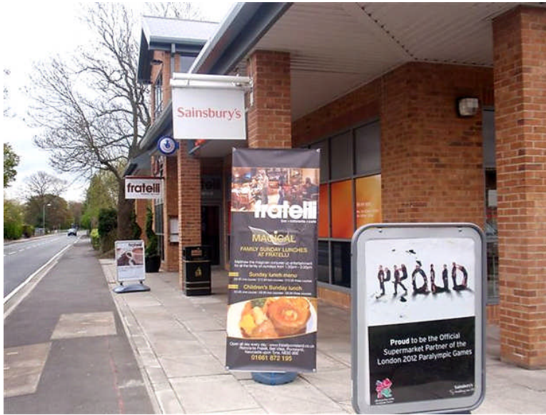
Fig. 5. The adjacent photograph was taken early in 2010 and shows three A-boards outside the Fratelli/Sainsbury building. Two belong to Fratelli's and one to Sainsbury's. All appear to be within the curtilage of the building but are nevertheless capable of providing a distraction to motorists.