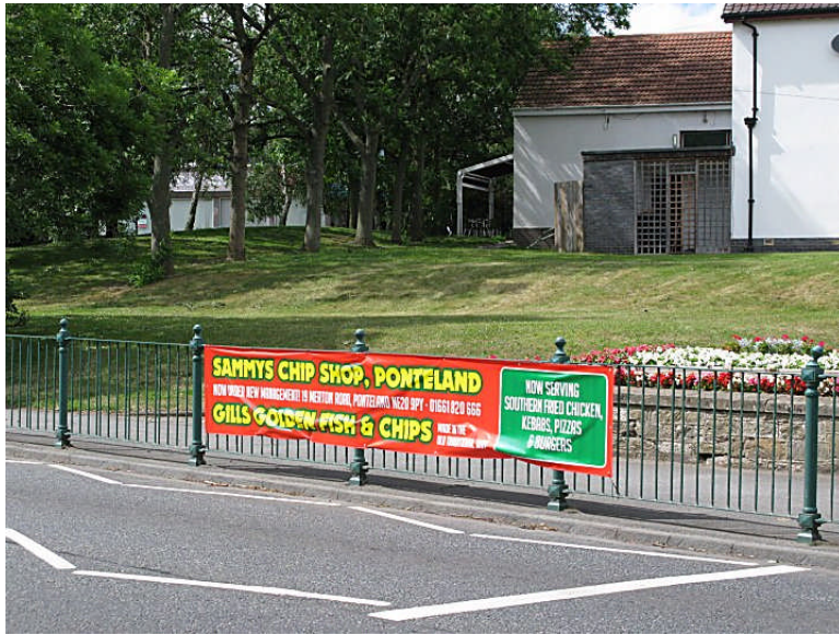
Fig. 23. This garish vinyl sign appeared for a limited period on the railings opposite the new Ponteland Park entrance and adjacent to the pedestrian-controlled crossing.