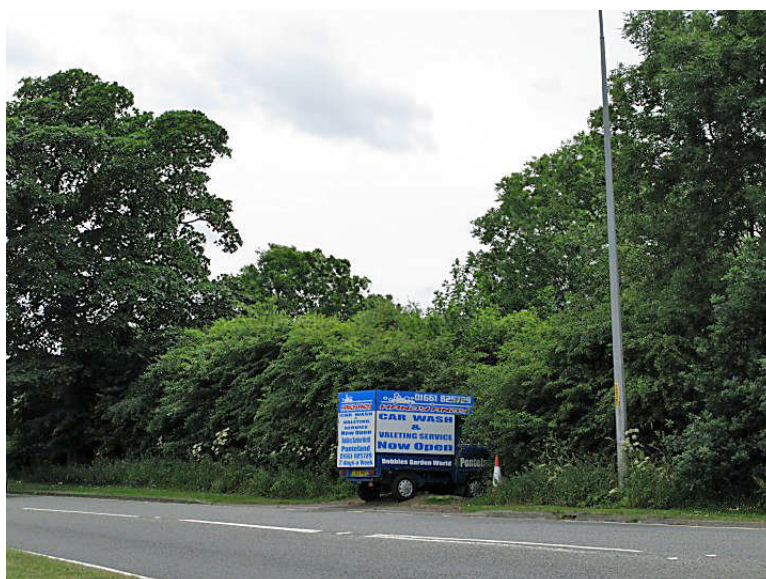
Fig. 19. The presence of this small van placed to provide an advertisement on the A696 has been commented on over at least the last year. Due to the piles of soil since placed over the field entrances it is now frequently to be found in field entrances on Rotary Way.