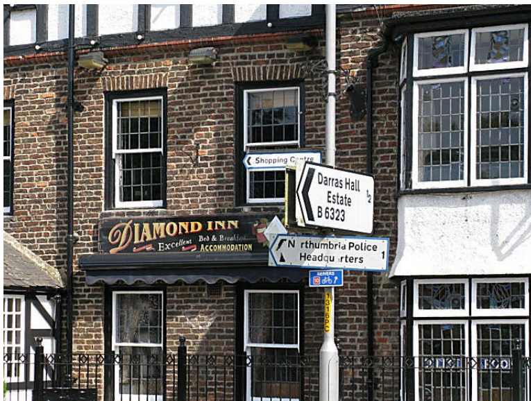
Fig. 33. This is a fifth sign for Darras Hall, which is followed after 400 yards by a sixth located opposite the entrance to Darras Road (not shown).

A further sign may be seen in the background ( Fig. 33, see below).