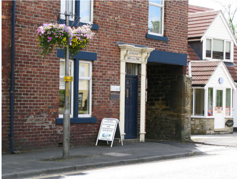
Fig. 14. Adjacent to the above, a related management company also has an A-board. Whilst this area might not have very many pedestrians and therefore such boards might not constitute a serious obstruction, such advertisements could prove a distraction for drivers.