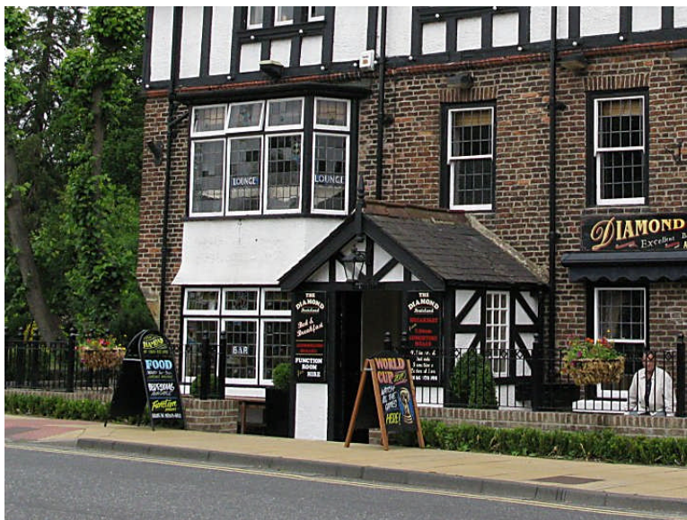
Fig. 3. Whilst, on occasions, only one A-board is used the landlord appears to have as many as three available and two are now quite regularly to be seen. Several boards of this kind may be a distraction to traffic and thus a safety hazard.