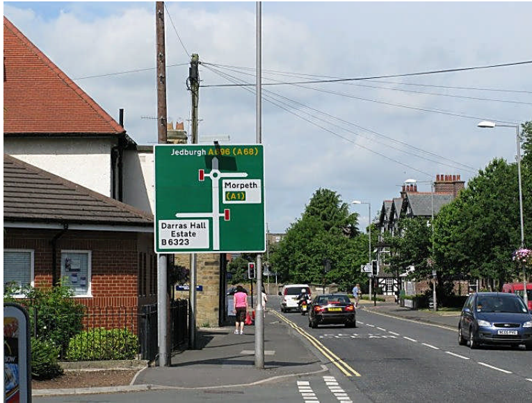
Fig. 32. This sign just before the traffic lights in Ponteland gives additional information but also includes the fourth indication for Darras Hall within less than a mile.

A further sign may be seen in the background ( Fig. 33, see below).