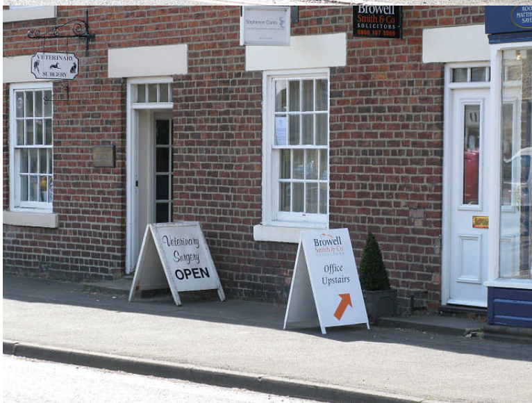
Fig. 12. The same might well be said of the A-boards advertising the adjacent services of a solicitor and a veterinary surgeon.