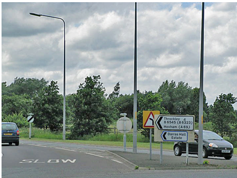
Fig. 31. This sign on the Dobbies roundabout repeats information given in the four immediately previous signs.