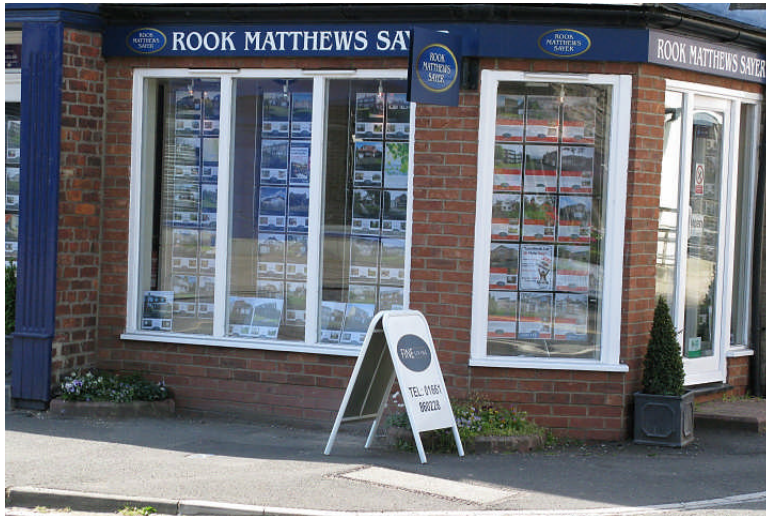
Fig.11. A Member commented that the Estate Agents Rook Matthews Sayer already had their name adequately represented on their shop front, and it was surely superfluous to place an additional A-board on the public pavement where it could cause an obstruction.