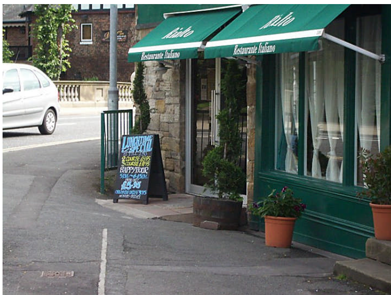
Fig. 4. Prior to its extension, the Rialto Restaurant placed an A-board on the pavement close to the steps on the right of the photograph. It is now placed adjacent to the new entrance. Although not obviously causing much of an obstruction, it may technically still be on the public pavement.