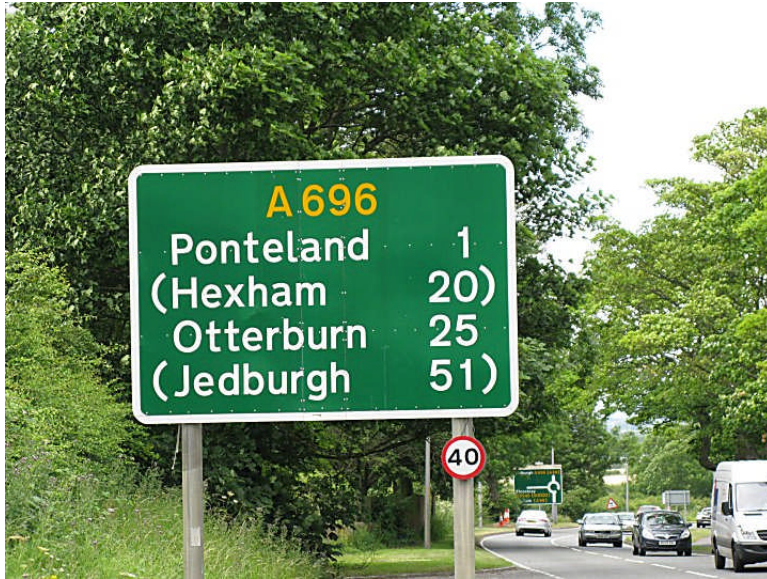
Fig. 29. The stretch of the A696 between the Dinnington roundabout and Main Street in Ponteland has a relatively large number of road direction signs within a very short distance. Possibly most of them may be considered necessary for motorists unfamiliar with the area, but some modest reductions could surely be made. This photograph, and those which follow, show the sequence going West.