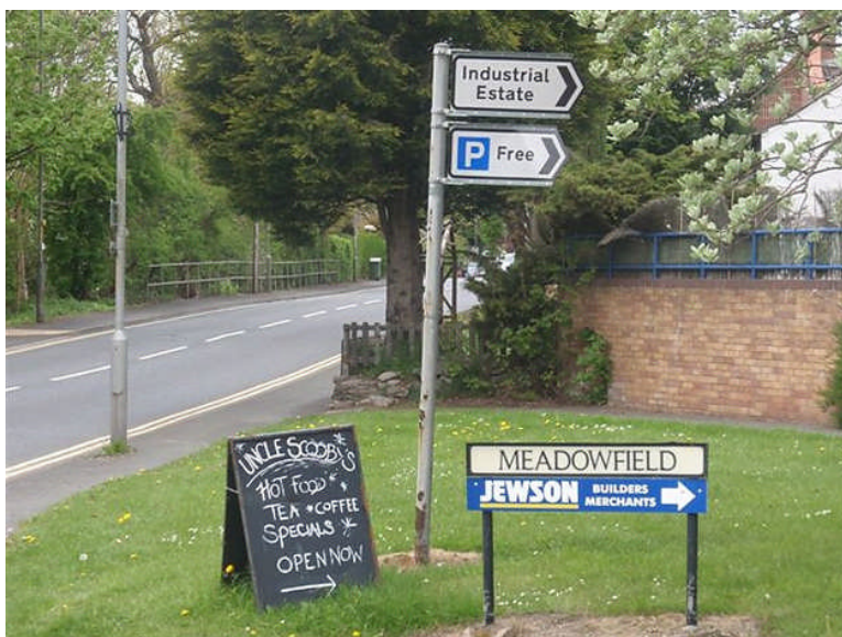
Fig. 7. An A-board is regularly to be seen on the grass verge where Meadowfield joins the A696. It is advertising food & drink available at a refreshment van usually parked on the public car-park 100 yards away. It is not known to whom the grass verge belongs.

This photograph was taken early in 2010 and the JEWSON sign placed on the road nameplate has since been removed