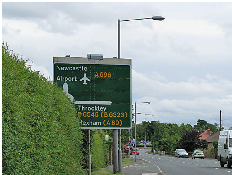
Fig. 28. This road sign going East just before the Dobbies roundabout is partially obscured.