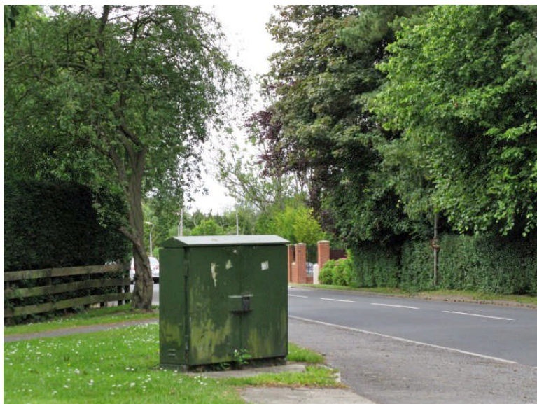
Fig. 25. Several respondents have referred to this Telecom cabinet which severely obscures the sight-line for traffic coming out of Eastern Way on to Darras Road. Others have also complained of obscured sight-lines on a number of Darras Hall road junctions, sometimes due to, or made worse by, overgrown hedges. One quoted in particular is at the junction of Woodside and Edge Hill.