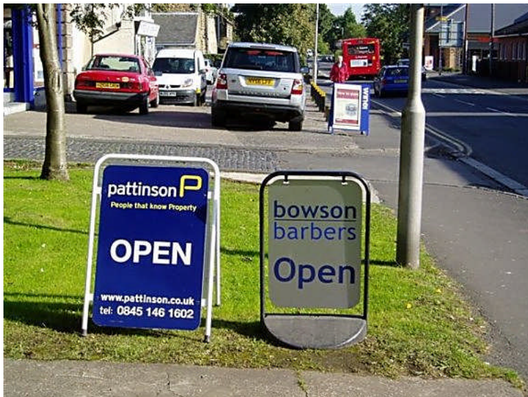
Fig. 15. Adjacent to the Smithy restaurant on Bell Villas, and looking East, can be found an A-board for another Estate Agent and yet another for a barber shop. Technically, these signs may be within the curtilage of the Bell Villas properties in which the businesses operate. The A-board in the background is serving the former Wine Rack store, which has ceased to trade since this photograph was taken earlier in the year.