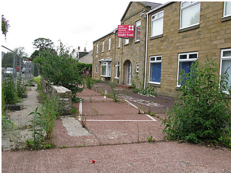
Fig. 22. This former industrial building in the Conservation Area at 45 Bell Villas has been vacant for some time. It has been much modified from its original housing purpose and a satisfactory alternative use for the site has not yet been proposed. Such a use is much needed, as it is not an asset in its present form. By coincidence, the long-term accumulation of weeds shown here was completely cleared some two days after this photograph was taken.