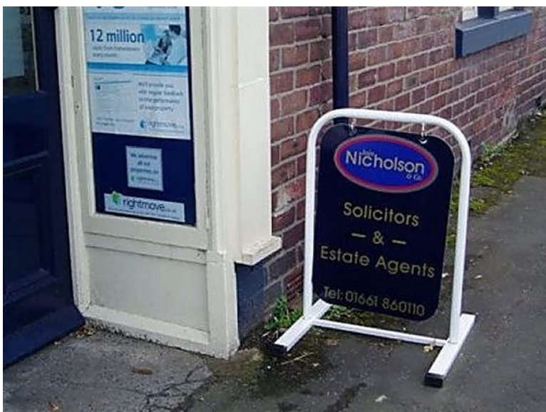
Fig. 13. A solicitor and Estate Agent on the West Road also advertises similarly.