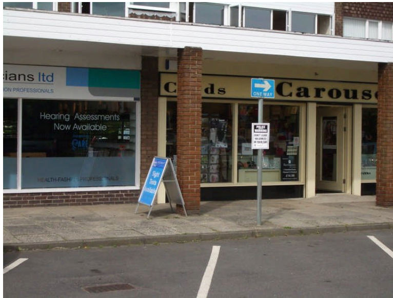
Fig. 17. One respondent complained that he nearly fell over it this particular A-board which was placed on the pavement outside an optician's on Broadway, Darras Hall. It might seem a little superfluous for an optician to advertise "sight tests available."