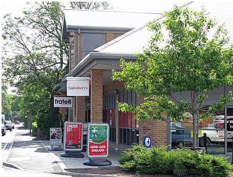
Fig. 6. This photograph was taken in July 2010 and shows four of up to six A-boards which are often to be found here, mostly belonging to Sainsbury's. Some do not appear to be advertising the store as such and could more appropriately be located inside. A Lottery advertisement has also appeared recently. Both goods vehicles and taxis sometimes pull up at this point, often on to the pavement; the presence of these signs at such times may be a safety hazard.