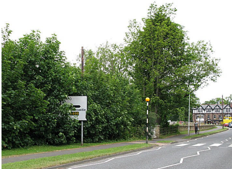
Fig. 27. This road sign opposite the entrance to the Ponteland Sports Centre is almost entirely obscured by an un-trimmed hedge.