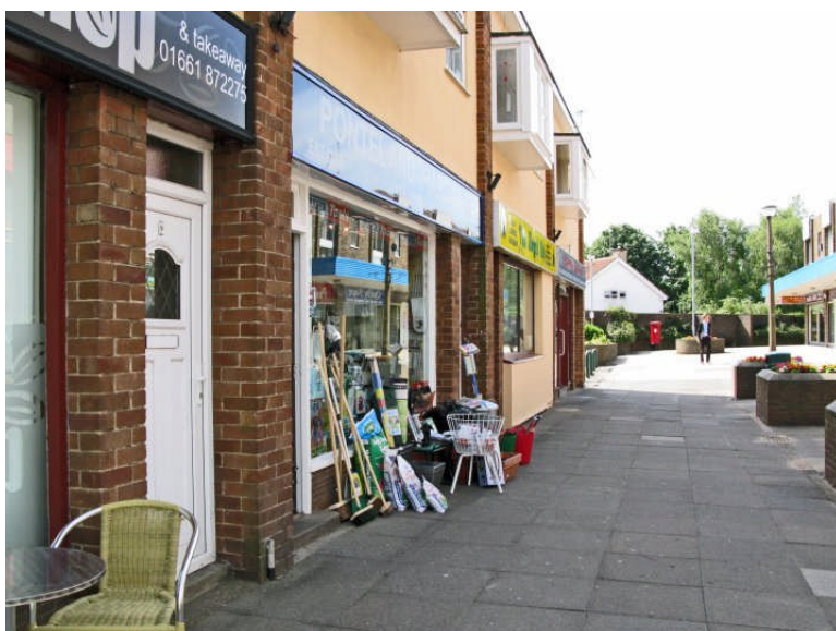
Fig. 10. The Hardware shop next to SAMMS has goods on display outside the shop and on the pedestrian area. The only comment made about this was that this kind of display provided more of a "market" feeling and thereby actually improved the atmosphere of the shopping centre. Comments of this kind should perhaps be remembered when considering the Regeneration proposals.