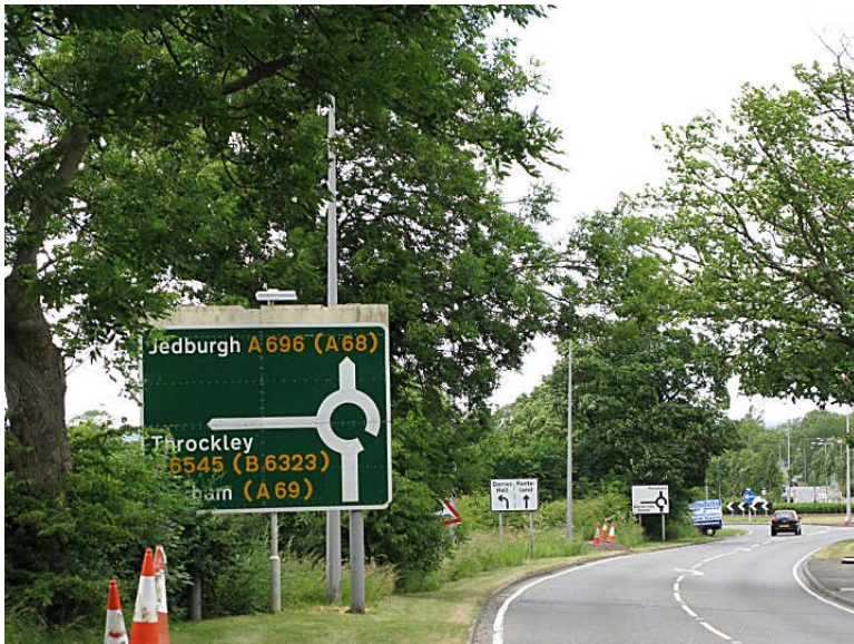
Fig. 30. This sign, seen in the background on Fig. 29, is partially obscured and gives alternative information. Note the two smaller signs in the background, both of which indicate Darras Hall to the left, and Ponteland straight on. Notice the small van (as Fig. 19) which in a position where it may cause distraction to drivers.