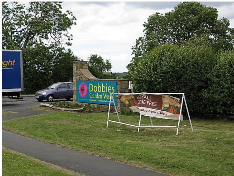
Fig. 18. Respondents have referred to advertising signs on roundabouts as being a serious traffic hazard. This vinyl canvas sign supported on a temporary framework was photographed outside the Dobbies roundabout on the A696 in July 2010. It is very similar to a proposed sign outside the Kirkley Hall entrance which was refused planning permission on the 9 th January 2009.