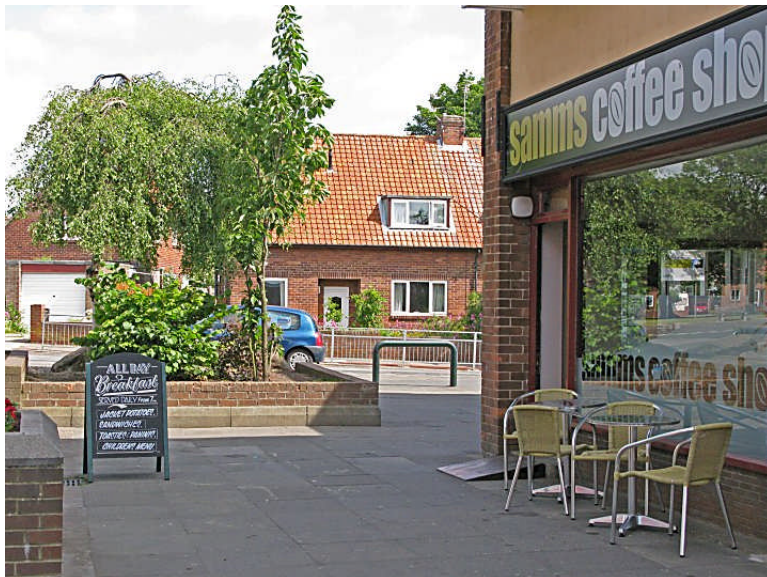
Fig. 9. This A-board is located on a pedestrian-precinct outside the new "SAMMS" coffee-shop in the Ponteland shopping centre. It does not present any real obstruction nor is it likely that it would distract motorists. (See below)