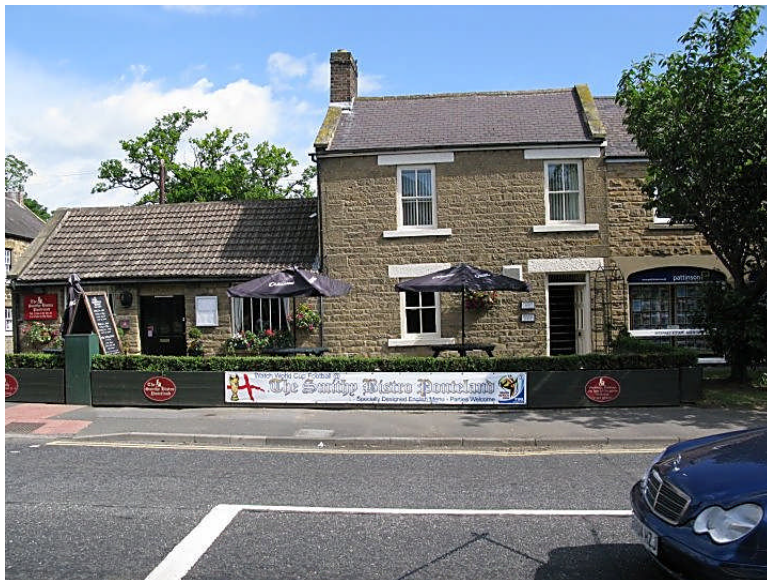
Fig. 24. A vinyl sign similar in size to the above was photographed in July 2010 placed on the fence bordering the Smithy Bistro at the Western end of Bell Villas. The Bistro also frequently has other advertisements visible above the hedge, as well as signs on the fence, as shown.