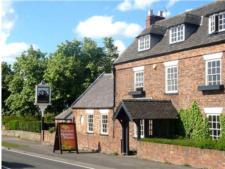
Fig. 8. This large A-board advertises Sunday Lunches at The Badger pub/restaurant at Streethouses. It is located on the public pavement outside the premises and, although it may be argued that few people actually walk that route and it is unlikely therefore to constitute an obstruction, such a sign nevertheless may constitute a distraction to passing motorists. On some days it is laid flat on the ground where it could form a hidden obstruction for pedestrians.