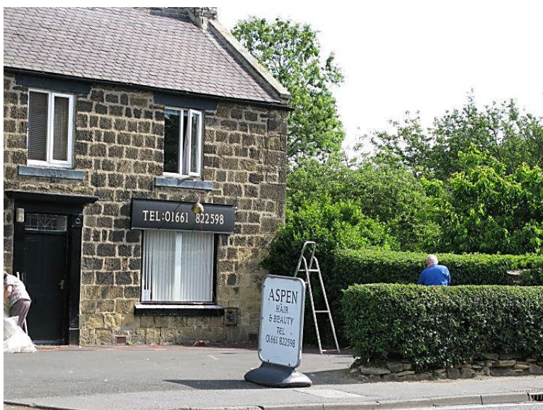
Fig. 16. This A-board advertises a hairdresser a little further east from those shown in Fig. 15 above. It is normally placed partly on the pavement. Like those above, and those outside the Diamond, it is in the Ponteland Conservation Area.