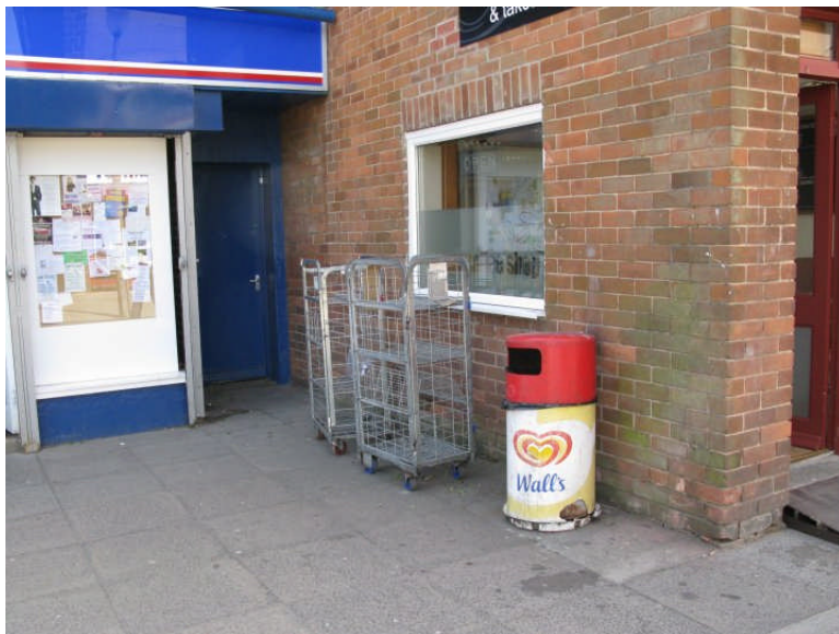
Fig. 21. The presence of a rusting waste-bin and empty goods trolleys between the Meadowfield newsagent and the SAMMS coffee shop brings a down-at-heel impression to this area.