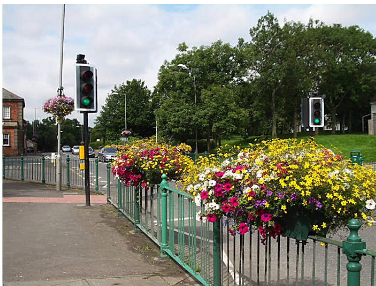
Fig.1. Two respondents commented: “Let us stop decorating our streets with planters attached to the top of ugly railings. Plants are most beautiful when in the ground.” But another said: “I would definitely not support the comment on planters attached to railings; I think the comment ‘the ‘plants are most beautiful when in the ground’ could lead to us being classified as archaic purists. Others said that: “window boxes, hanging baskets & planters attached to railings, lamp posts, etc., have all played a significant part in making our towns and cities more attractive. The more, the better.”