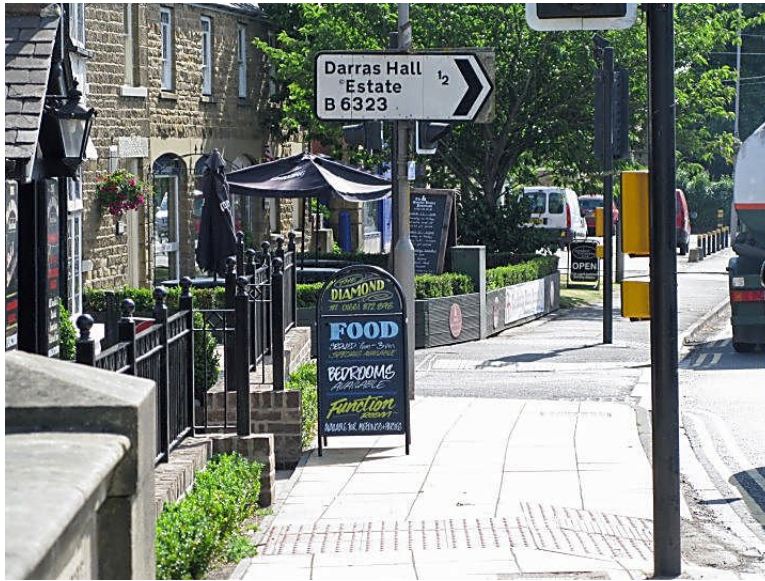
Fig. 2. A number of complaints were received concerning A-boards located outside eating-establishments of all kinds including takeaways. In the case of the Diamond they have chosen to erect railings, both to provide somewhere for people to drink outside and, incidentally, to also delineate the limits of their property. This has left them with few places to place advertising material other than the public pavement. The location of such A-boards obstructs the pavement and is much too close to the pedestrian crossing for safety.