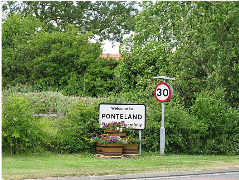
Fig. 26. The planters may be attractive, but when they block part of the Welcome Sign it appears untidy. This may be seen on the A696 near the Dobbies roundabout.